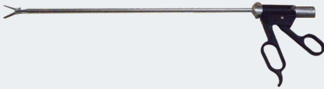
Reusable 5.0 MM Laparoscopy Instrument ( With Fixed Insert )