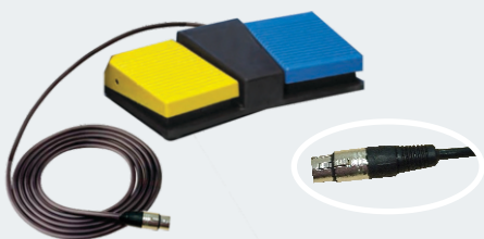
Double Pedal Footswitch For Bipolar & Seal